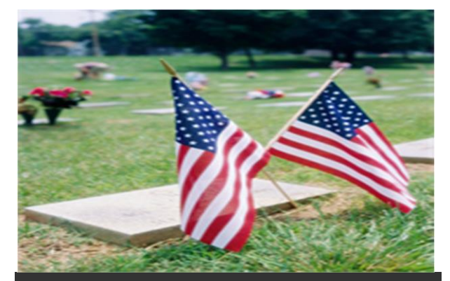
Absolutely no alcohol or glass containers allowed in the cemetery.

We ask that family and friends visit frequently in order to remove old decorations, remove overgrown grass and weeds and anything else that will ensure the beauty of their loved ones lots as well as the cemetery.